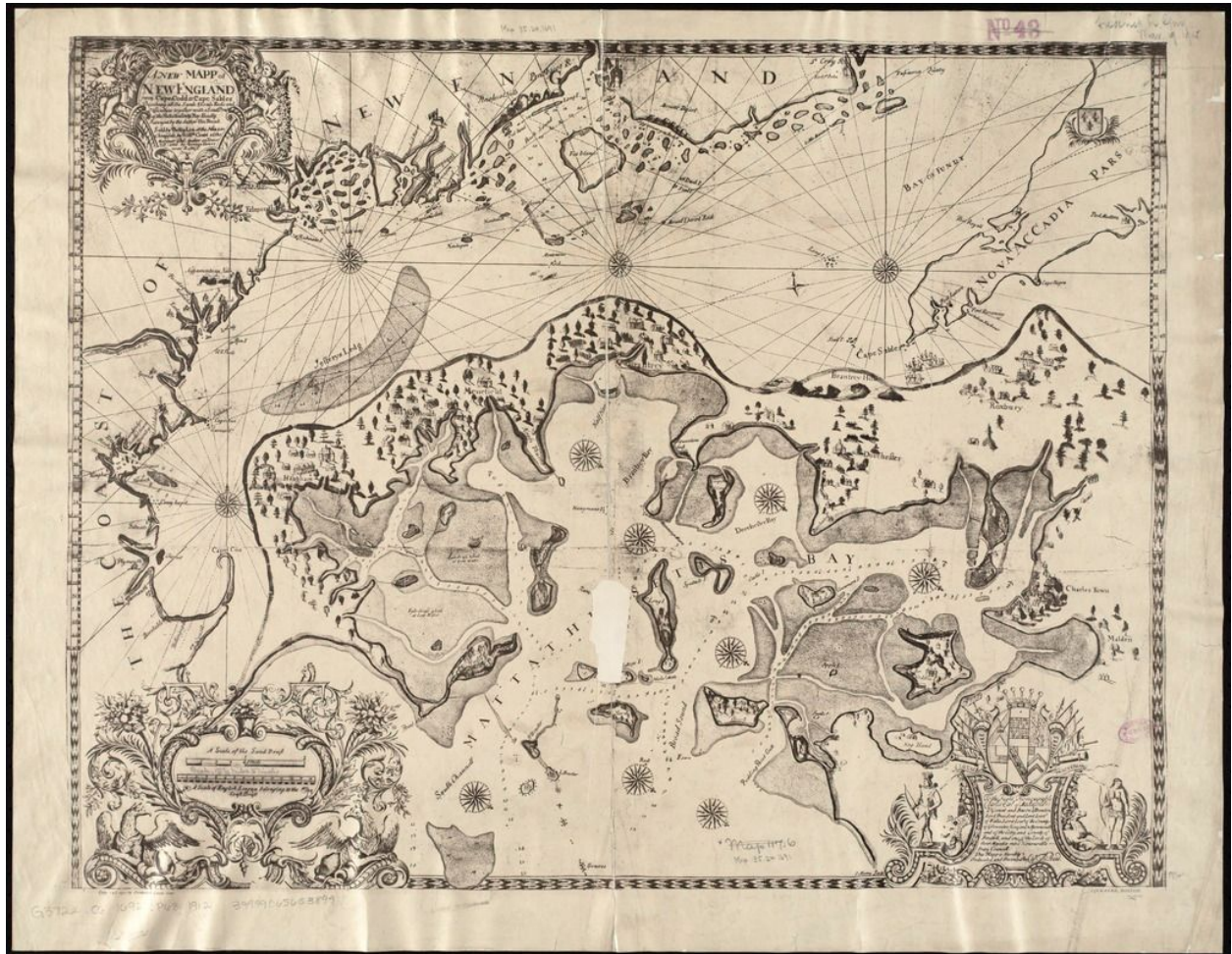
Location of the first wave of métissage at Port La Tour 189

To summarize, the region of Cape Sable, Acadia/Southwest Nova Scotia, especially at Fort Saint-Louis and Port La Tour, has been an area which many Sang-Mêlés have called home, from the early days of what was once known as Acadia to the present day. Moreover, the donation of land at the Passage of Cape Sable on the coast of Port La Tour given by Charles de Saint-Étienne de La Tour's son, Charles de Saint-Étienne de La Tour fils (Junior) to Joseph mieuse (Joseph Mius D'Azy) and his heirs in April 1713 indicates precisely the ancestral lands of the Mius family—the same geographic area in which the initial wave of métissage took place.